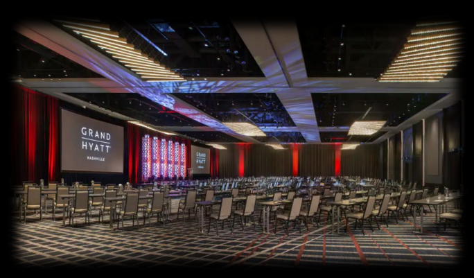
Exhibit Dates: MAY 22-25

Grand Hyatt Nashville Hotel 1000 Broadway, Nashville, TN 37203 615-622-1234