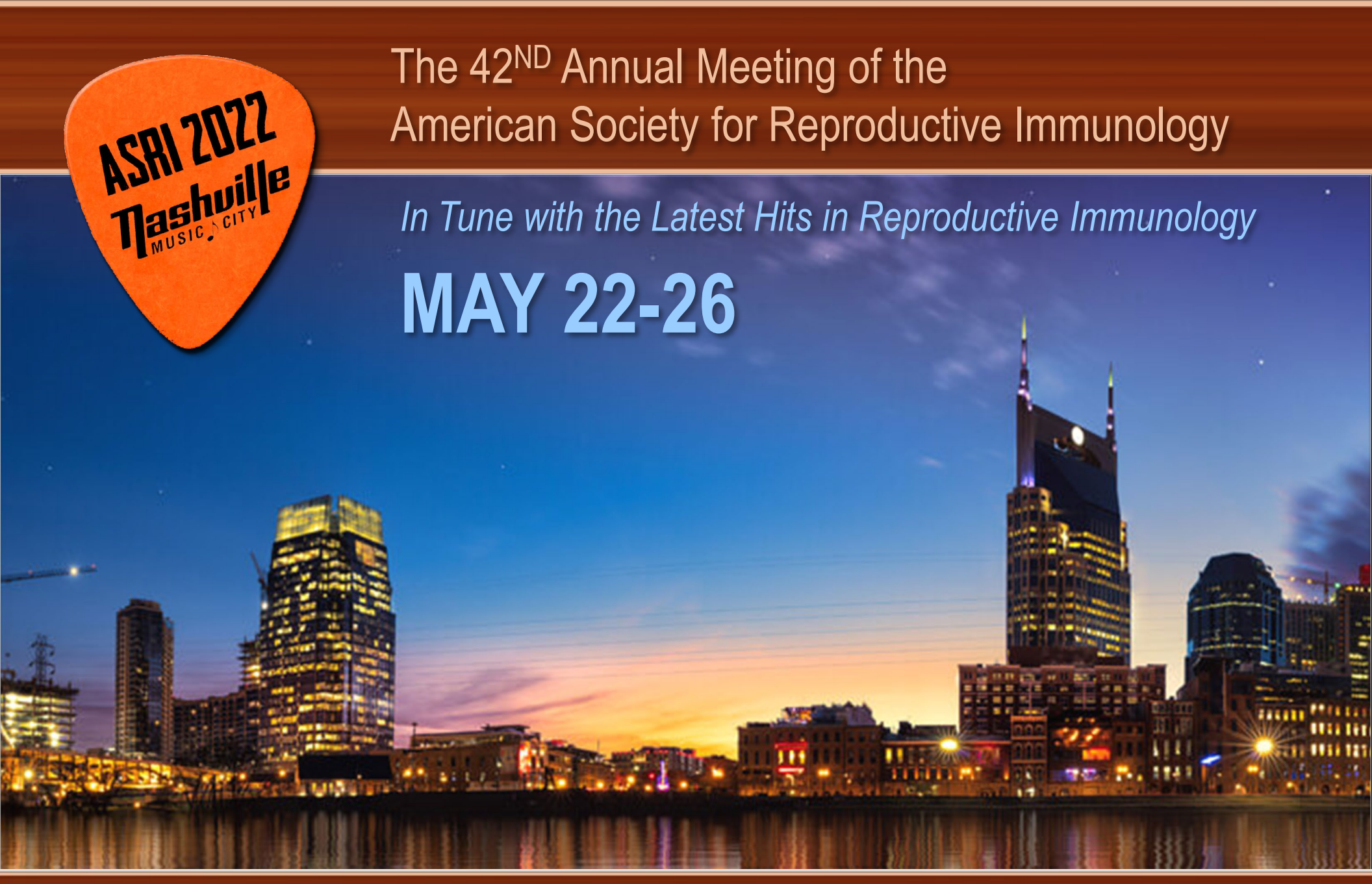
EXHIBIT SPONSOR ADVERTISE SUPPORT