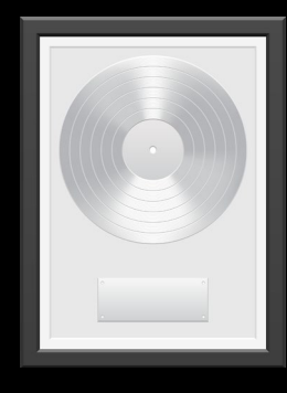
SILVER ALBUM SPONSOR